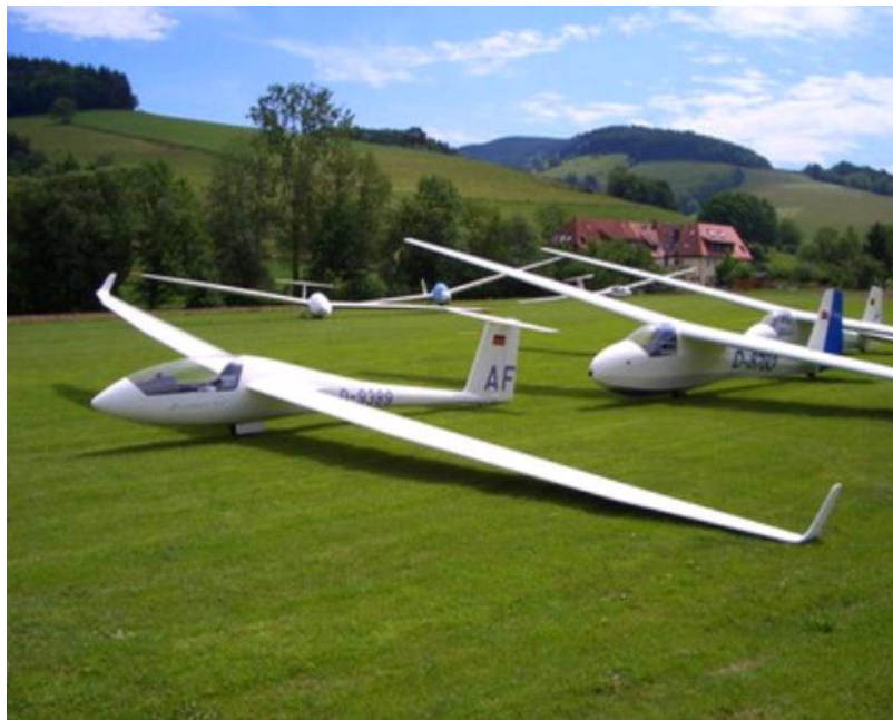
OGC's latest acquisition to its fleet - a 1997 Discus CS