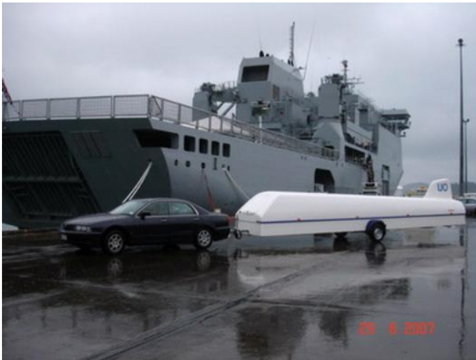
UO Trailer at Lyttelton alongside HMNZS Canterbury

The brand new DUO Cobra trailer arrived in style on the 28 th June sailing up the Lyttelton Harbour on HMNZS CANTERBURY, escorted by helicopters its navy crew impressively standing to attention along the decks, to be welcomed at its first port of call in NZ by a Government Minister, band, top military personnel from the Ministry of Defence, Army, Navy and Air Force with gold sashes and medals aplenty, Maori challenge and Haka.